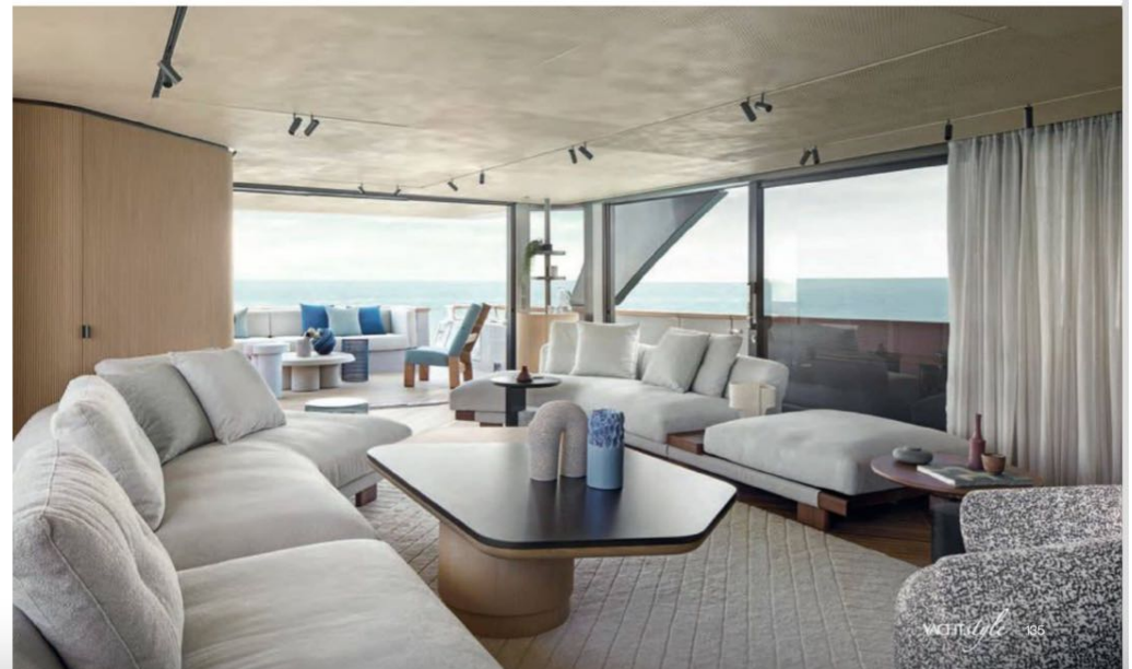
Aft view of the saloon, where the aft doors can be put away to starboard and another sliding door can open on the port side

The saloon is airy enough with the aft doors put aside, yet in addition, a large glass door on the port side can slide forward to