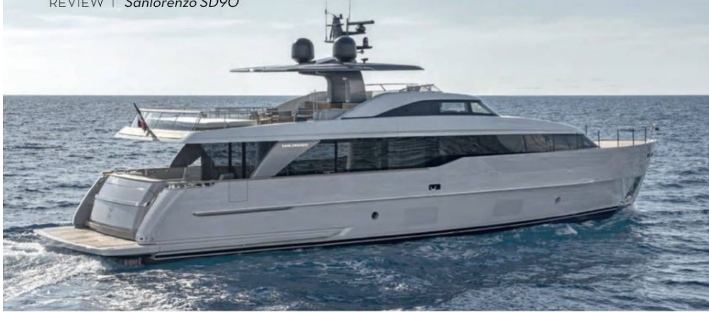
Bernardo Zuccon of Zuccon International Project designed the exterior of the SD90, having designed most current Sanlorenzo models

The Sanlorenzo success story in Asia shows no signs of slowing down. Almost all models from its Yacht ranges – SL, SD, SX and SP – are present in or sold to this region. Even the radical 40-knot, triple-waterjet SP110, the first model in the new smart performance series, was sold by Sanlorenzo Asia soon after the model's world premiere at the Cannes Yachting Festival in France last September.