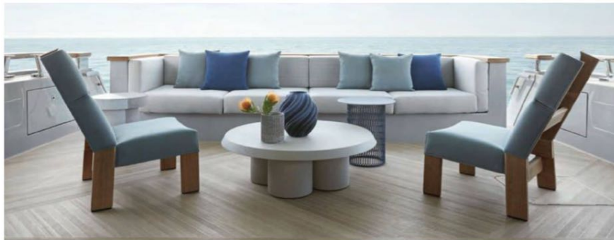
Like all indoor and outdoor spaces on the SD90 in the photos, the aft cockpit on the main deck features furniture by Patricia Urquiola