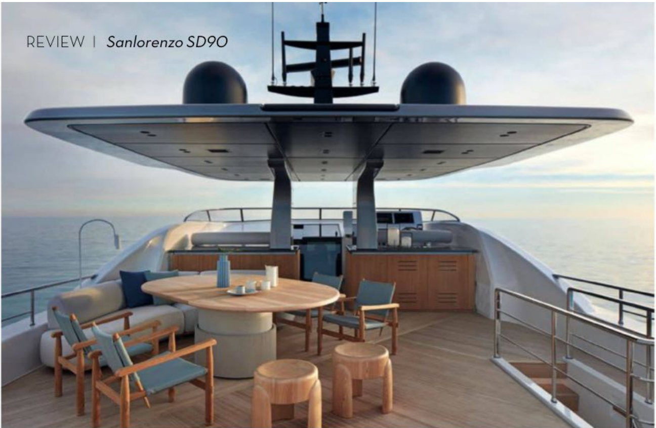
Forward view of the flybridge, most of which can be dressed with loose furniture; forward are the wet bar, the helm station and companion seating

As with the eco-friendly materials used, Sanlorenzo has paid great attention to the yacht's equipment and systems, with the Eco air-conditioning system, energy-efficient light fixtures, high-performance thermal and acoustic insulation, and Eco Mode stabilising fins examples of the brand's focus on high quality and low consumption.