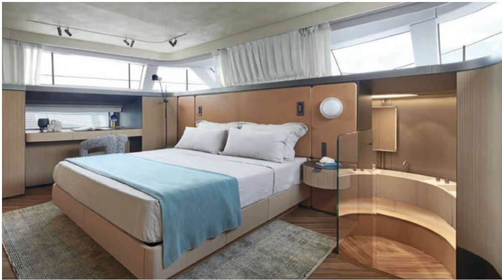
The owner's suite occupies a full-beam space forward on the main deck, with the en-suite bathroom set three steps down in the forepeak

provide a wide opening beside the lounge. In the aft port corner, the ribbed oak panelling is again seen around a cylindrical, 'floating' fridge that doubles as a drinks table supported by a full-height pole. It's a gorgeous piece of design.