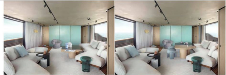
The saloon features a freeform coffee table by Urquiola that can be transformed into a dining table

With the optional 1.150hp CAT C18 engines, the SD90 has a top speed of 17 knots but more importantly, it has a significant range of 1,200nm.