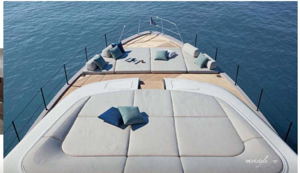
The forward area includes a fitted sunbathing area forward of the wheelhouse and a flexible foredeck area that can be dressed with sunpads

Forward are stairs down to the crew quarters, which includes a crew mess with C-shaped sofa and a foldable table, two twin-berth cabins, two bathrooms and the laundry facilities. Aft, the garage can house a 4.3m (14ft 1in) tender up to 600kg.