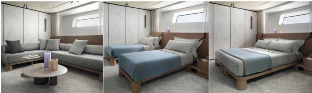
On the lower deck, the jolly cabin can be enclosed or open and set up as an entertainment room, twin cabin or double cabin

The lower-deck stairs, flanked by an industrial-style mesh grill, lead first to the 'jolly cabin', which embodies Urquiola's focus on transformability. Sliding 'pocket' doors mean the multifunctional guest