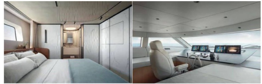
White ribbed oak panelling is used in the starboard guest cabin (left); the semi-raised pilothouse (right) is refreshingly light

area can be open to the hallway, while the single beds can be arranged as an L-shaped sofa, so creating an entertainment, games or children's room.